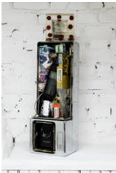
Brute Force Phreak HQ, 2015 Payphone, Magnets, Ball Bearings, Iron Filings, 2600 Magazine, Frame, Silver Gelatin Print 27 x 8 x 10 inches (68.58 x 20.32 x 25.40 cm)