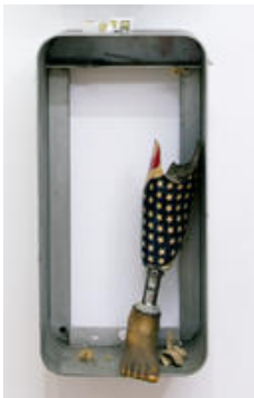
Untitled (Payphone Shell), 2015 Payphone Shell, Prosthetic Leg, Thistle, Cellphone Debris, Cigarette Case 36 x 19 x 12 inches (91.44 x 48.26 x 30.48 cm)