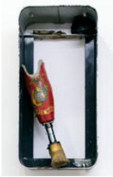
Untitled (Payphone Shell), 2015 Payphone Shell, Prosthetic Leg, Ball Bearings, Debris 36 x 19 x 12 inches (91.44 x 48.26 x 30.48 cm)

134 Bowery, 4S NY, NY, 10013 info@lomex.gallery 917.667.8541